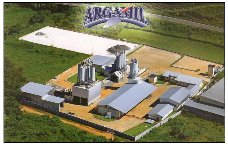
Picture 4. The mortar factory using tailings as input at Padua cluster.